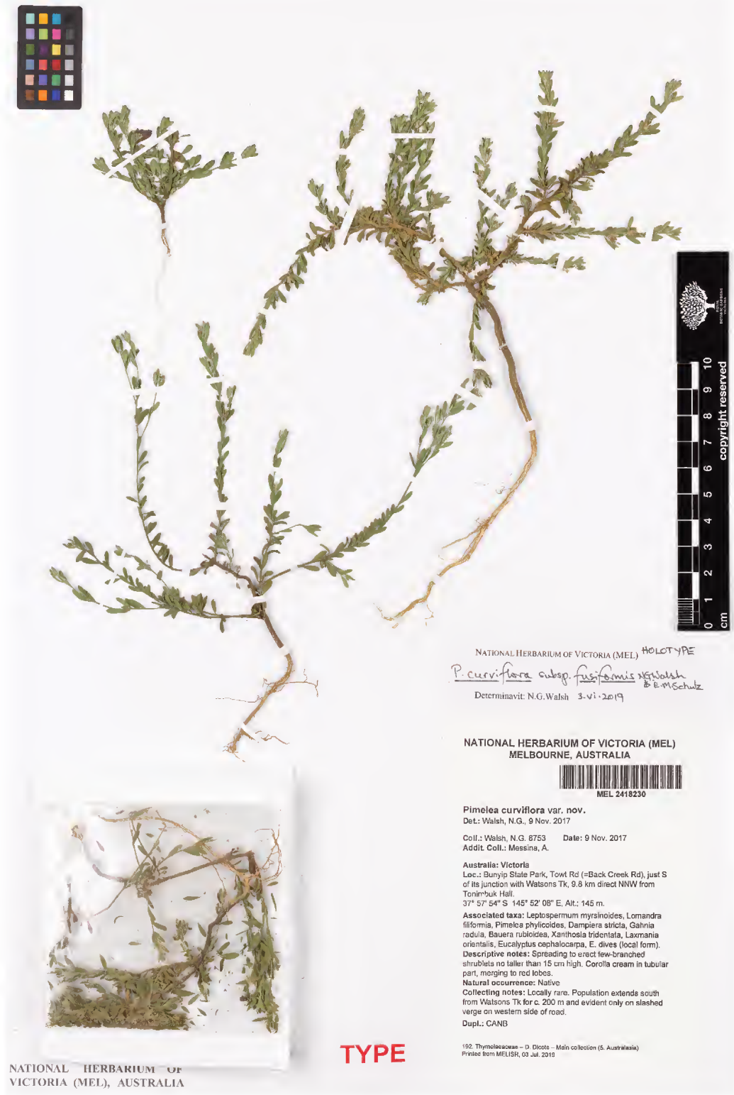
Figure 2. Holotype of Pimelea curviflora subsp. fusiformis (MEL2418230).